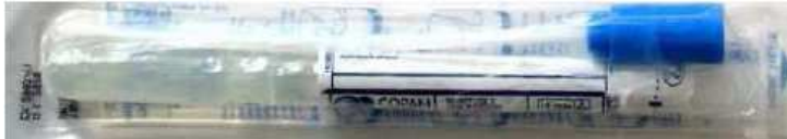
Blue top Bacterial Swabs with Transport Medium (Not for PCR)