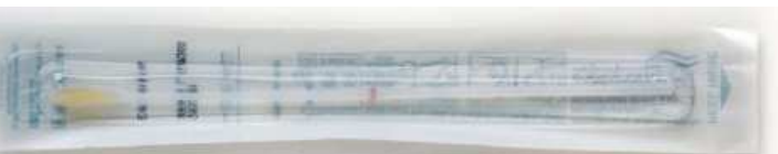
Flocked tip with Nylon fiber