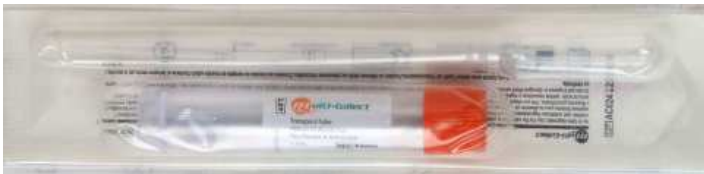
Multi-Collect Transport Tubes