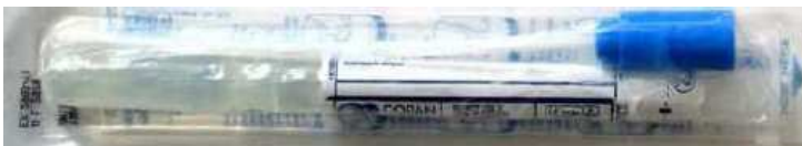
CERVICAL SWABS for Mycoplasma, Ureaplasma